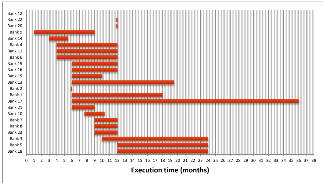
Figure 2. Execution time for full disposal options

83. As shown in Figure 3, all the analysed recovery plans, apart from one, included capital raising measures through public offerings, based either on rights issues or IPOs. Proposed timeframes ranged from 1 month to 8 months, with around 80% of institutions estimating that options’ execution timeframes would not exceed 4 months. In contrast to divestment options, more than half of institutions specified an expected execution time, instead of providing expected time ranges.